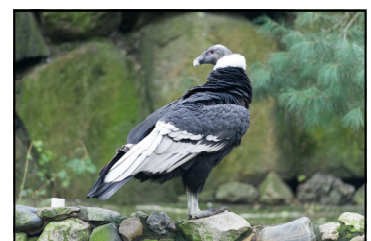
Andean condor the national bird