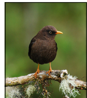
yigüirro the national bird