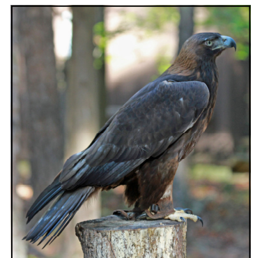
golden eagle the national bird