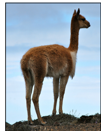
vicuña the national animal