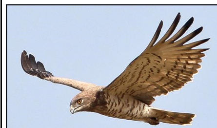
short-toed snake eagle the national bird